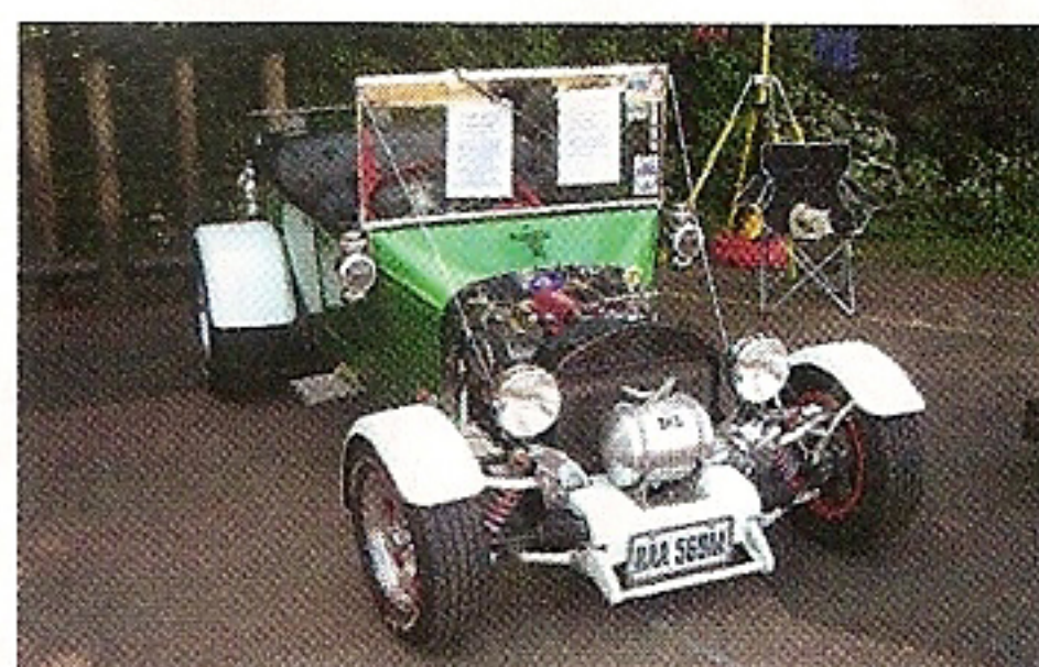
1973 Jago packs NOS-injected crossflow

Cougar. "I put straight-through pipes on after getting annoyed with people asking me if it had a V8 because it was so quiet," she said.