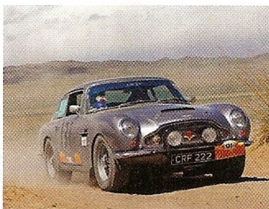
Classics have a keen following in China, as proven by the '07 Peking-Paris rally

Coming back down to earth and to a different topic, the FBHVC Legislation Committee deals with many matters linked with the DVLA. We have an excellent working relationship with the DVLA, which listens to and answers our questions on various subjects. We could see from the high numbers attending our presentation at Clubs Expo 2010 at the HMC, Gaydon, that there is a demand for more information. We hope to include the topic in a future FBHVC conference and intend to invite the DVLA along to our discussions.