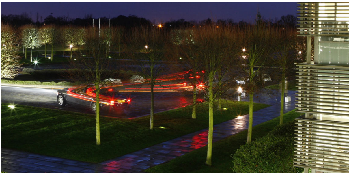
Rolls Royce Headquarters & assembly Woodward.

Places for this interesting day out are limited so if you are able and would like to attend please let me know as soon as possible.