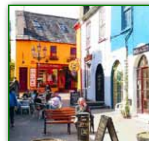
KINSALE - One of the most picturesque, popular and fashionable resorts of the south-west coast of Ireland. Famous for yachting, sea angling, Dolphin & Whale Watching Trips, gourmet restaurants and golf. The Town nestles between the hills and the shoreline, a maze of narrow streets, never far from the water and little changed in many hundreds of years.

Depart Killarney on N22 south west over Derrynasagart Mountains before taking a right turn at Ballyvourney south west via Coolea and then hairpin left to Ballingearry. Then take the R584 southwest for Ballylickey via the Keimaneigh Pass and Shehy Mountains. Joining the N71 turn southbound to Bantry. Sightseeing optional stop at Bantry House and French Armada Museum. Continue south on N71 to Skibbereen then onwards on N71 eastbound to Clonakilty. After exiting Clonakilty following the N71, take the R600 to Kinsale via Timoleague and crossing the estuary bridge.