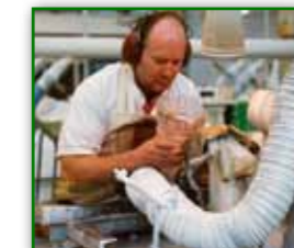
WATERFORD CRYSTAL - Home of the world's finest crystal, a visit to the Waterford Crystal Visitor Centre is a must-see. Marvel at the luxury pieces commissioned for celebrities, view the impressive display of trophies produced for International sporting events and indulge in a little retail therapy in the world's largest display of Waterford Crystal.

From Midleton, continue on the N25 eastbound through Youghal and Dungarvan towards Waterford. On N25 just 2 miles west of Waterford, recommended stop - The Waterford Crystal Visitor Centre (Factory tour is currently not operating)